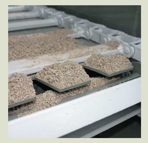
Smoother material flow

Ask us about your most challenging material.