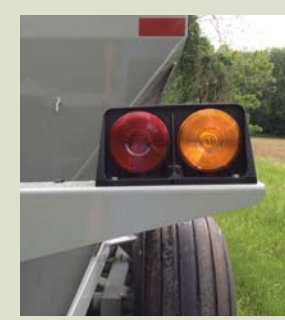
Optional tail lights

Heavy duty blades chop up any clumps and gives a smoother flow of material onto the spinners.