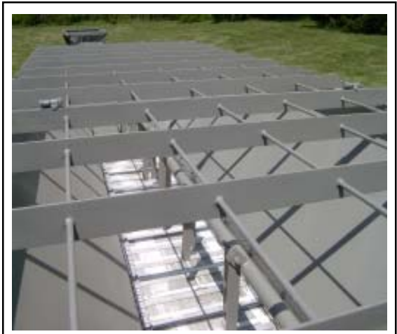
Low rpm flail agitator breaks up bridging in the stickiest materials.