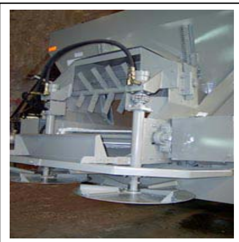
Low rpm "shredder" breaks up lumps for a smooth flow of material onto the spinners.