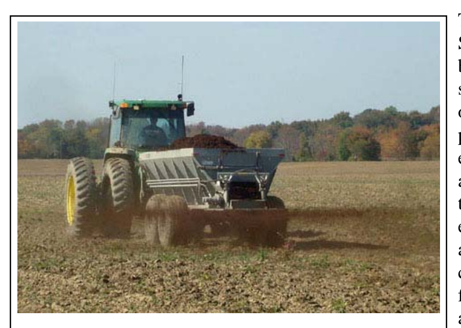
Spread widths from 40 to 65 ft, depending upon the material.

The Stoltzfus Sludge Spreader is designed for broadcasting heavy, sticky sludge from water or wastewater treatment plants. It is also rugged enough to spread damp ag lime, precise enough to spread fertilizer, and easily spreads compost and poultry litter. Application rates can vary from 500 to 13,000 lb / acre.