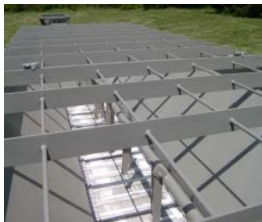
Low rpm flail agitator breaks up bridging in the stickiest materials.

Stoltz Mfg., LLC 121 Morgan Way, PO Box 527 Morgantown, PA 19543 610-286-5146 800-843-8731 fax: 610-286-6600