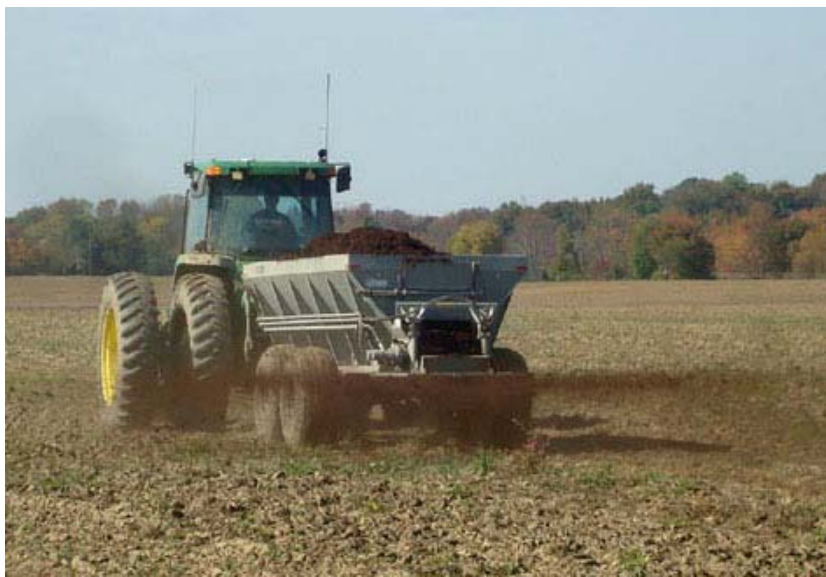
Spread widths from 40 to 65 ft, depending upon the material.

The Stoltzfus Sludge Spreader is designed for broadcasting heavy, sticky sludge from water or wastewater treatment plants. It is also rugged enough to spread damp ag lime, precise enough to spread fertilizer, and easily spreads compost and poultry litter. Application rates can vary from 500 to 13,000 lb / acre.