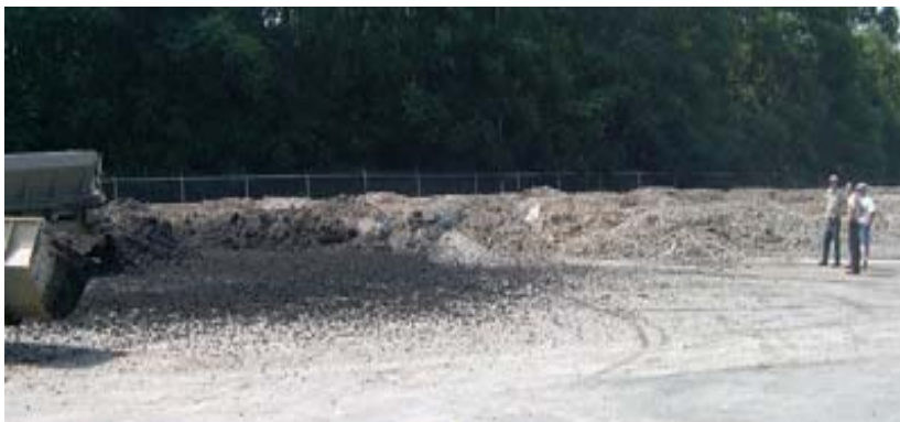
Spread pattern testing with wastewater treatment sludge.

Model 1516 has a 223 cu.ft. (8.3 cu.yd.) hopper and a 15 ton capacity running gear. The 30 inch wide drag chain and the steep (53 degree) sides and UHMW plastic floor liner insure that the hopper empties completely.