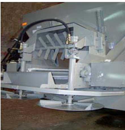
Low rpm “shredder” breaks up lumps for a smooth flow of material onto the spinners.